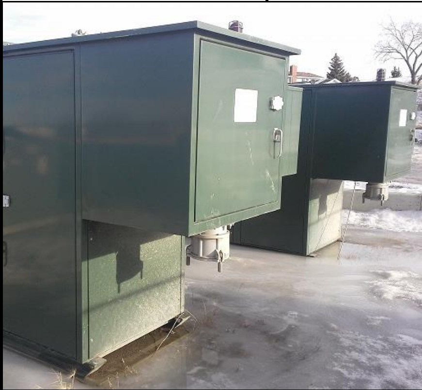
Shown Above: MCS Manufactured 15kV, 600A Female Equipment Mount Couplers in service