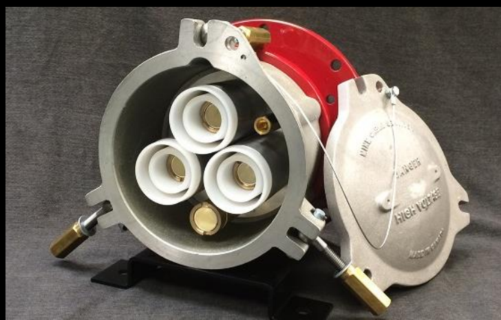
15kV, 600A Female Equipment Mount Shielded Coupler shown with silver plated contacts, phase shielding and optional powder coated body.