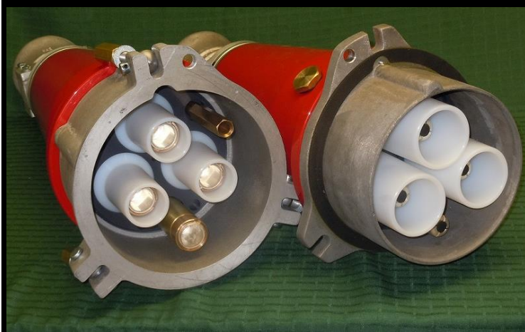
15kV, 600A Male & Female Cable Mount Unshielded Coupler shown with silver plated contacts and optional powder coated body