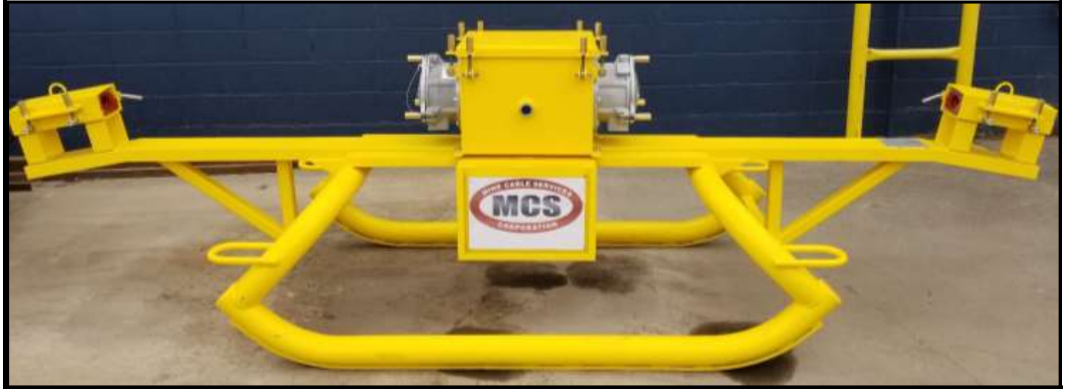
Shown Above: MCS Standard Heavy Duty Rocking Horse Skid in use with MCS 15kV Square Body Junction box